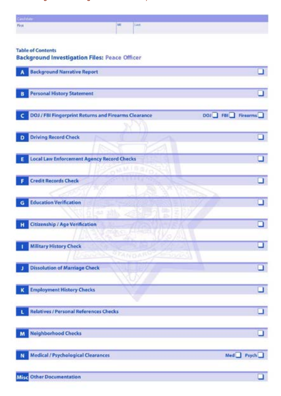
Table 6.1 BACKGROUND INVESTIGATION AREAS OF DOCUMENTATION – PEACE OFFICER (As shown in the Background Investigation Tab Dividers)